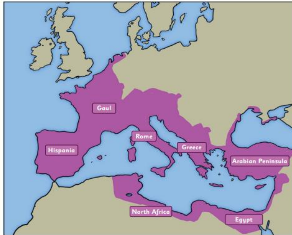
The Roman Empire in the time of Emperor Claudius